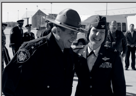
Col. Colleen Ryan, 88th Air Base Wing commander, interacts with participants of the C-5 Dedication Ceremony at the 445th Airlift Wing flightline.